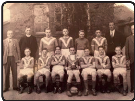
The Town Council proudly display the original Gregg Cup in our Council Chamber.

This photograph was taken around 1936-1937 – can anyone provide the names of these young footballers?